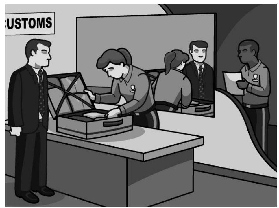
Figure 2 Airport Security. Baggage Inspection