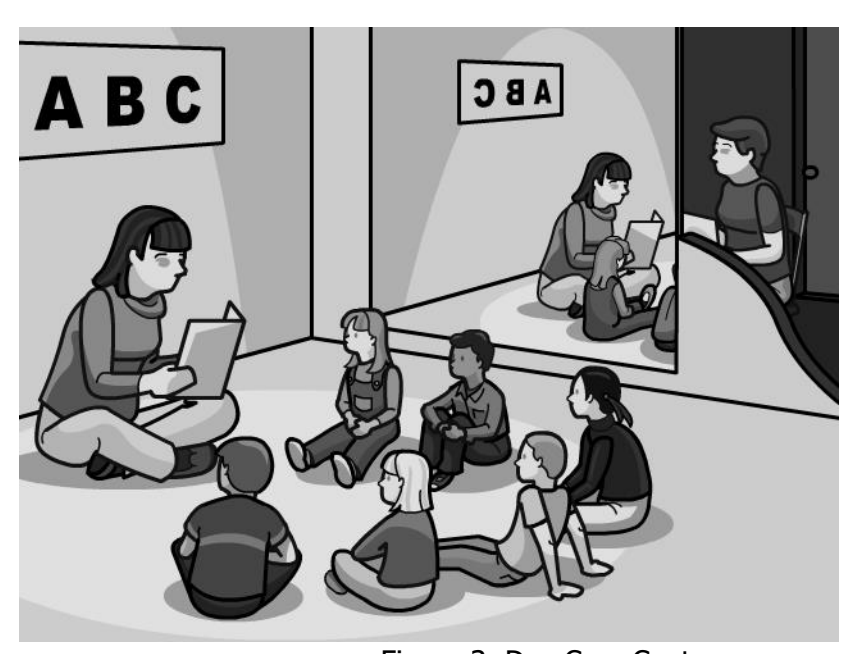
Figure 3 Day Care Center