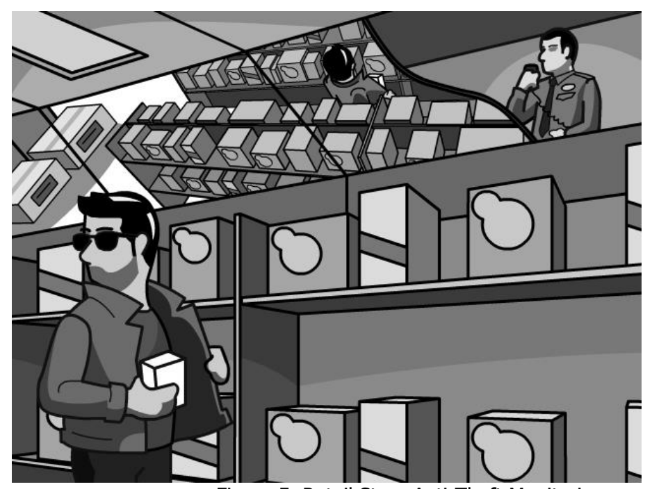
Figure 5 Retail Store Anti-Theft Monitoring