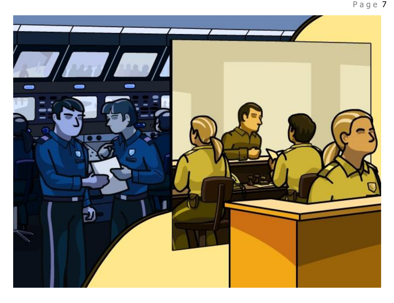
Figure 6 Airport Security. Immigration