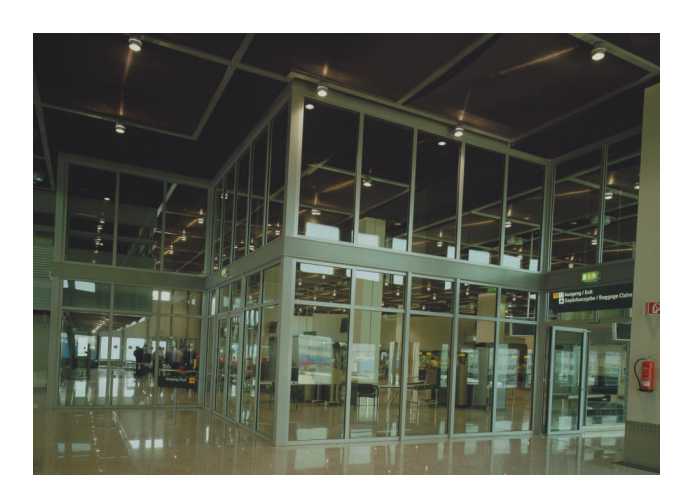
Pyrostop glazing at Düsseldorf Airport

Although glass is not combustible, monolithic panes of sodium silicate glass are not an effective barrier to the propagation of fire. The traditional way of enhancing the fire resistance of glass is a wire mesh. In a fire, wired glass still cracks like annealed glass would do. In contrast to normal glass, however, the fragments are kept together by the wire mesh, thus protecting the unexposed side from flames, smoke and combustion gases. This product is called Pilkington Pyroshield<sup>TM</sup>, today's most widely used fire resistant product. Wired glass was designed to prevent the fire spreading. When glazed in an appropriate frame, it encloses flames, smoke and hazardous gases. It also offers some resistance against accidental human impact.