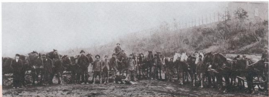
Breaking ground for Edward Ford's new plant at Rossford

A host of events took place for the culmination of the 2023 celebration of Rossford's 125th Anniversary and NSG Group was proud to be a sponsor for such a momentous occasion. The afternoon of Friday, July 28, featured tours of our Rossford plant and the participants were thrilled and thankful for the opportunity to peek inside the big plant. That night was the official grand opening at the Rossford High School. And Saturday's (July 29) events included the 125th Anniversary Parade in the morning and concluded with a very special 125th Anniversary Riverfest Celebration that evening.