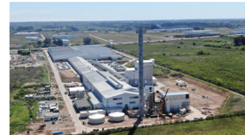
New float furnace in Argentina