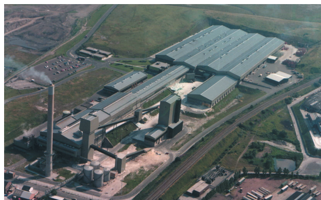
UK5 float line, St. Helens

Engineering activities are undertaken within an integrated business-based stage and gate project management process. This is designed to ensure that all functions within the business play their part in bringing investment projects through successfully, by ensuring that all the required inputs are defined and built into the schedule.