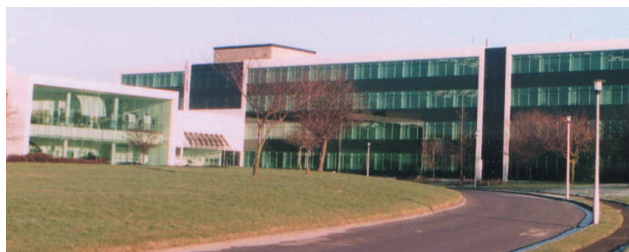
European technical centre, Lathom