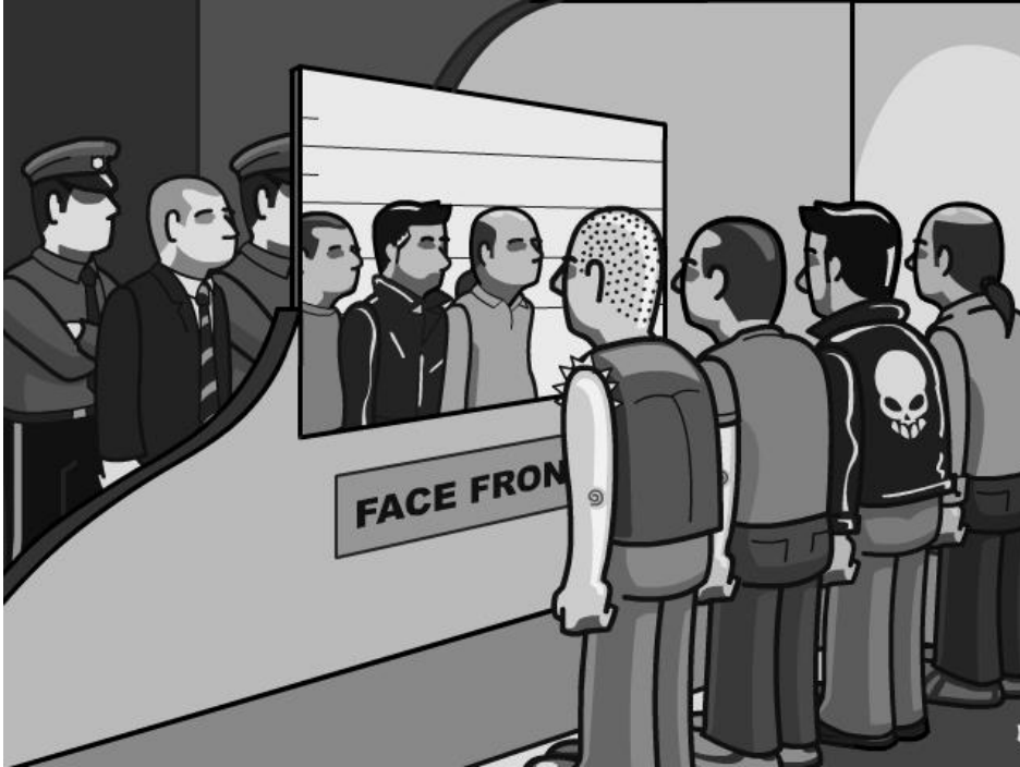
Figure 4 5.3 Police Identification Line-up