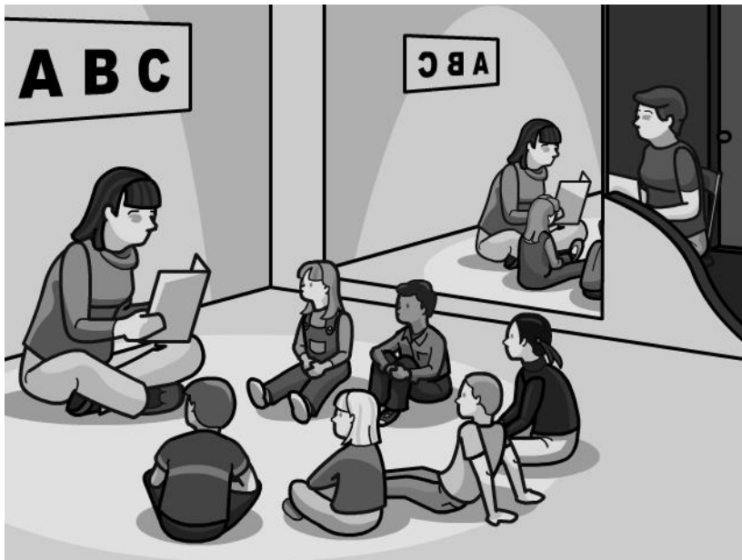
Figure 3 Day Care Center