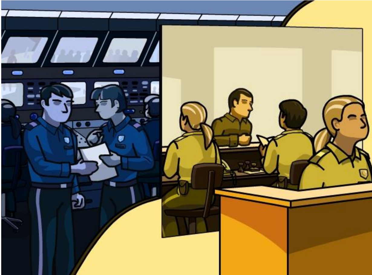
Figure 6 Airport Security. Immigration