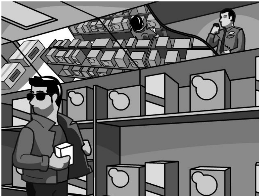
Figure 5 Retail Store Anti-Theft Monitoring