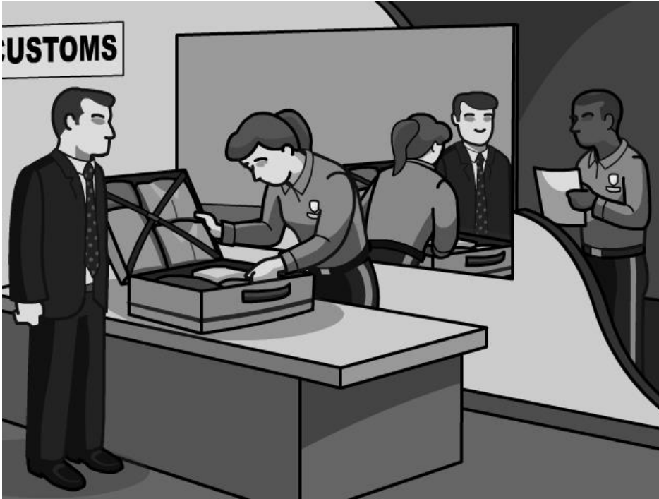
Figure 2 Airport Security. Baggage Inspection